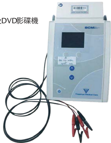
Body composition monitor 人體成份監測儀

本中心歡迎來港旅客和海外病人預約血液透析服務。本院提供不同語言的傳譯服務，並設有日語傳譯部門。