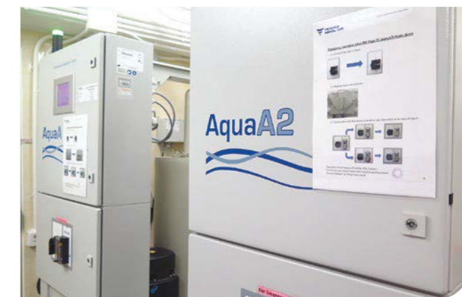
Reverse osmosis water treatment system 淨水處理系統