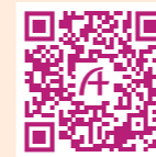
Service Information 服務詳情

40 Stubbs Road, Hong Kong 香港司徒拔道40號 (852) 2835 0651 haemo@hkah.org.hk