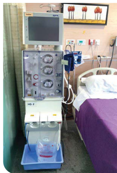
Online HDF system 線上透析過濾治療系統

HDF with online preparation of substitution fluid (online HDF) is one of the most effective dialysis modalities and combines the advantages of diffusive and convective elimination of uremic toxins, particularly for middle-size molecules. HDF shows superior clearance capability in comparison to standard hemodialysis.